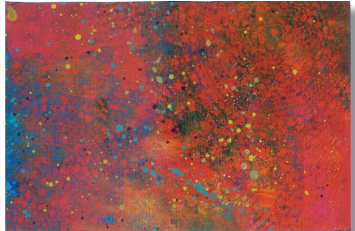
Abstract 1, Jennifer VonStein

Both types of varnishes are applied with a brush, so use a soft brush reserved just for varnishing. The size of the brush should be appropriate to the piece. Do not overwork a varnish; just lay down one stroke at a time, slightly overlapping and do not work back into it. It usually takes 2 to 3 coats of a varnish to achieve an even sheen. You can work horizontally for the first coat; once dry, apply the second coat vertically, which will cover the holidays (the sections where the varnish did not catch). For some works, applying varnish in the direction of the painting's brush strokes will provide a more pleasing result. Practice varnishing on an old or failed piece of art whenever you try a new varnish or sheen. Varnishing is not difficult but with any new skill, practice makes perfect!