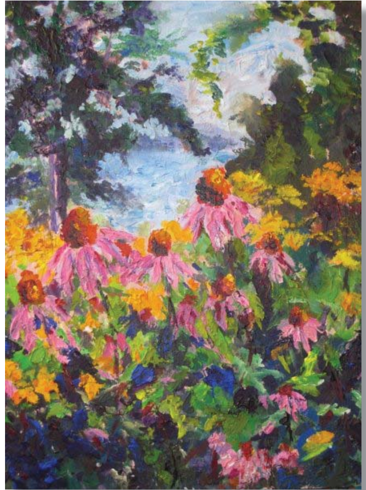
Coneflowers, Jennifer VonStein

Each of these mediums can be mixed directly to Interactive or applied directly to the surface for a variety of effects. Just remember that if you mix either of these mediums with Interactive, you will not be able to reopen the paint layers. However, when you add these mediums to Interactive, you will create a mixture that is more impasto and will take longer to become touch-dry. This will allow you more time to explore.