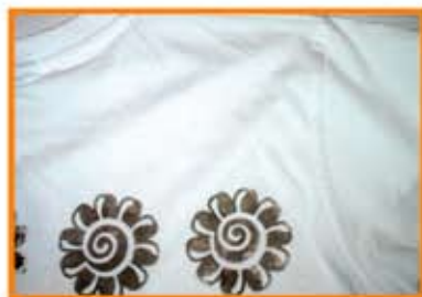
Mix Textile Medium with Chromacryl Waterproof Drawing Ink to stamp pictures onto T-shirts.