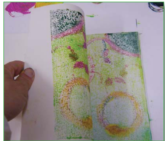
Pulling Ghost Print