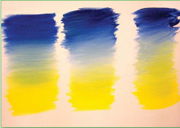
Painting Into The Couch