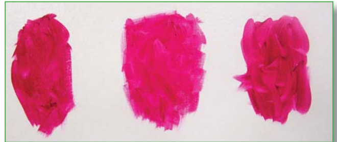
Clear Painting Medium Slow Medium Thick Slow Medium