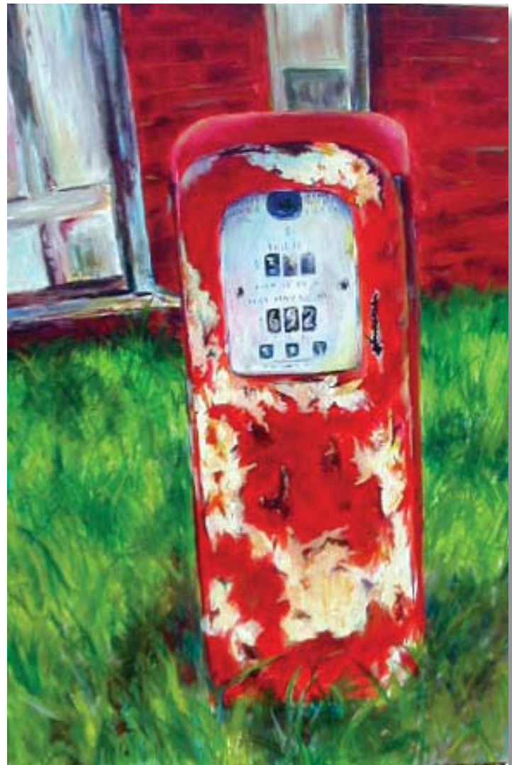
Gas Crisis, Jennifer VonStein

Clear Painting Medium is probably the easiest medium to use and understand. It essentially contributes more water to the paint, making it easier to create and spread a mid-viscosity paint. It helps retain water, useful when learning to use the Fine Mist Water Sprayer because it reduces the risk of runny paint due to overuse of the spray. It is also useful for glazing because transparent colors need to be diluted without becoming runny in order to create the right balance of transparency.