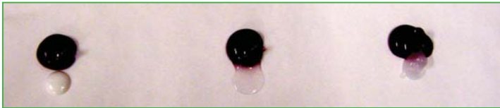
Clear Painting Medium Slow Medium Thick Slow Medium