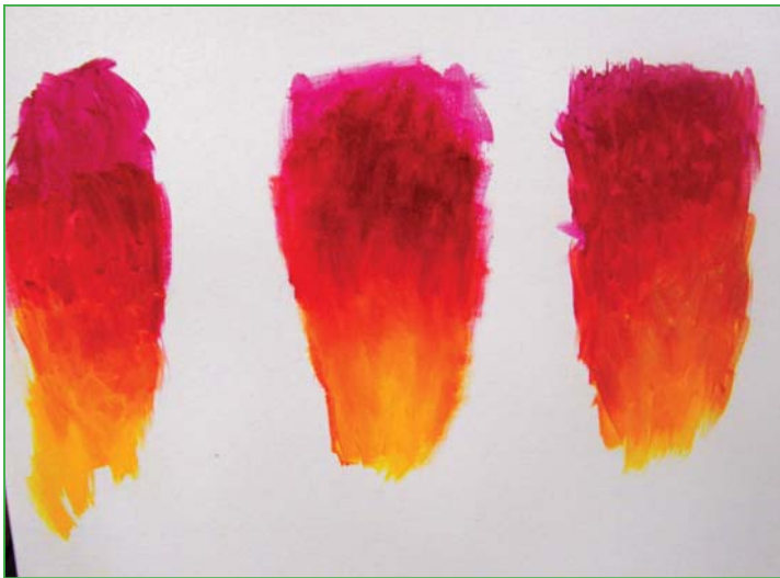
Painting Mediums Mixed With Interactive

Painting into a couch of Slow Medium is an excellent way to achieve smooth gradations of color without harsh edges.