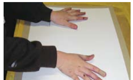
9. Gently rubbing the back of the paper whilst holding it in place with your free hand