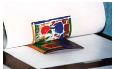
10. Pulling the print