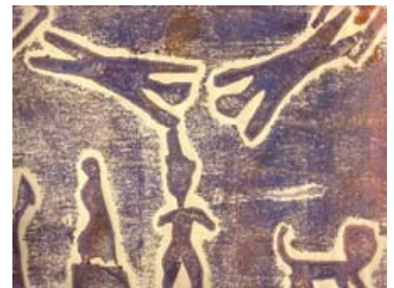
Example of ‘the print’, mirror image