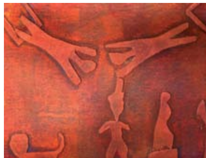
Example of ‘the card block’ by art student 8 years of age

Materials for card printing in the class room are normally easy to find. A list of recyclable materials including cardboard, cereal boxes, old manila folders, plastic containers and newspaper should be given to students to bring from home. Papers can be of different colours and of varying quality; from white cartridge to brown and coloured.