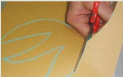
3. Cutting the drawn shape