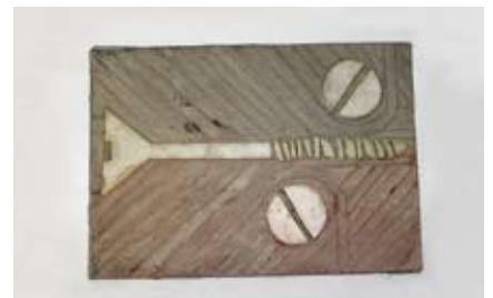
8. A3 paper with centred block facing up