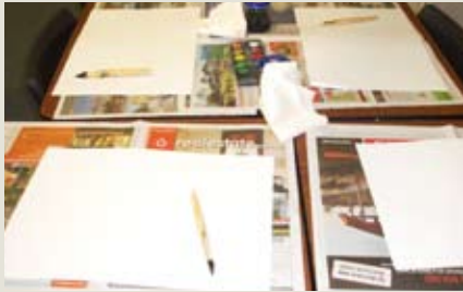
1. Room arrangement