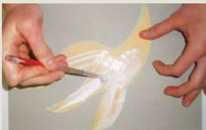
4. Glueing the cut out shape