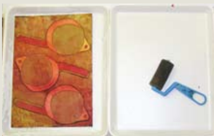
5. Block sitting in tray ready for the paint to be applied

PRINTING AREA – a clean, dry table where the A3 cartridge paper is placed and printed on with the paint coated block facing up.