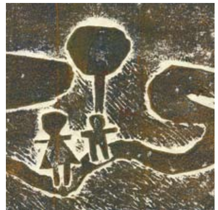
A walk in the park