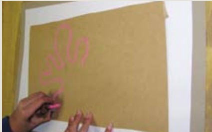
2. Drawing large shapes onto card