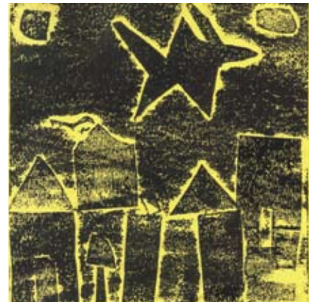
The village at night