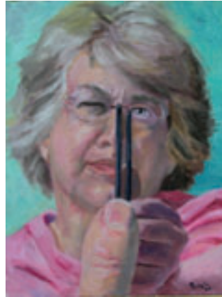
Self Portrait In Mirror