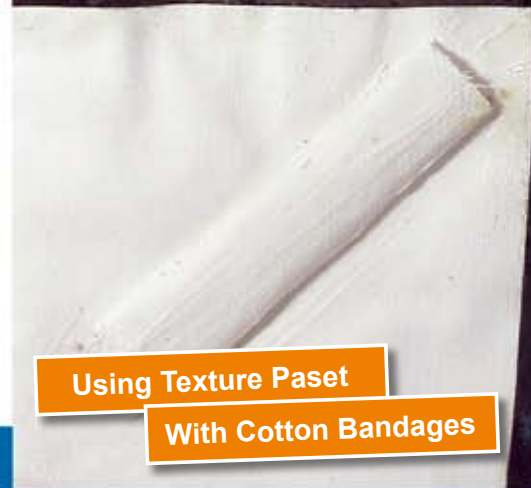
Using Texture Paset