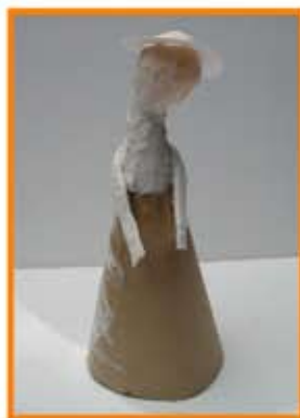
Use Texture paste with cotton bandages to create sculptures.

Place the stencil onto the canvas and smear Chromacryl Texture Paste over it. Lift the stencil up slowly, leaving a texture paste form to paint over.