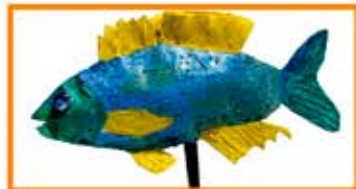
Sculptures can be over-painted with Chromacryl.